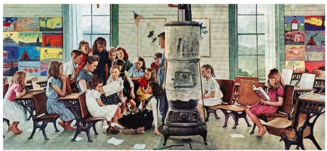
Norman Rockwell Visits a Country School copied from The Saturday Evening Post