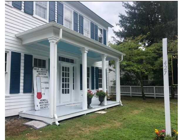
Lightning Jack's Foundation - painting c. 2023