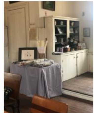
The area between the two foyers is, again, a Gift Shop, and it is open for business!